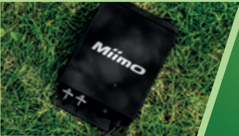
Multi Miimo Box accessory enables Miimo to detect which stations are unoccupied

The new Multi Miimo system by Honda enables teams of Miimo HRM 3000 robotic mowers to work together to manage large areas of grass. There are no limits to the number of mowers that can be used, and the system has been designed to be used in areas exceeding 4.000 m² with a maximum boundary wire length of 1.000 m.